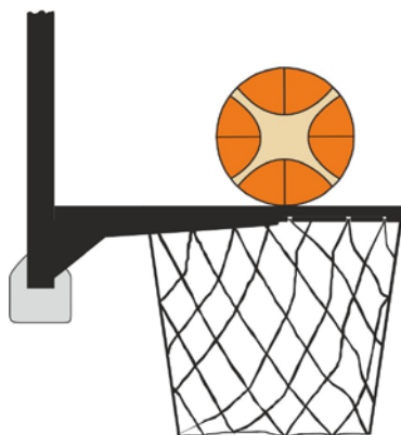
Diagram 2 Ball in contact with the ring

31-15 Statement. Interference violation is committed by a defensive or offensive player during a shot for a field goal when a player touches the basket or the backboard while the ball is in contact with the ring and still has a chance to enter the basket.